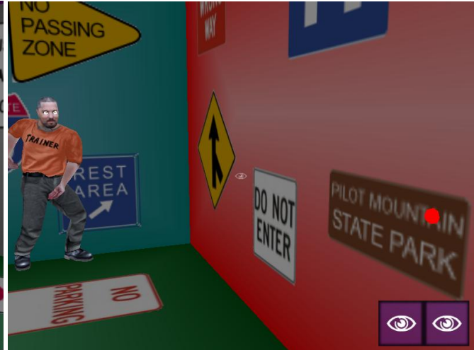
(b) Referee's view (with referrer's lightspot visible).