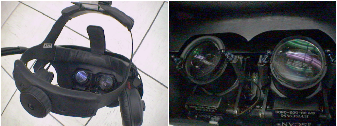
Figure 6: HMD (a, left) equipped with (b, right) binocular eye tracker optics.