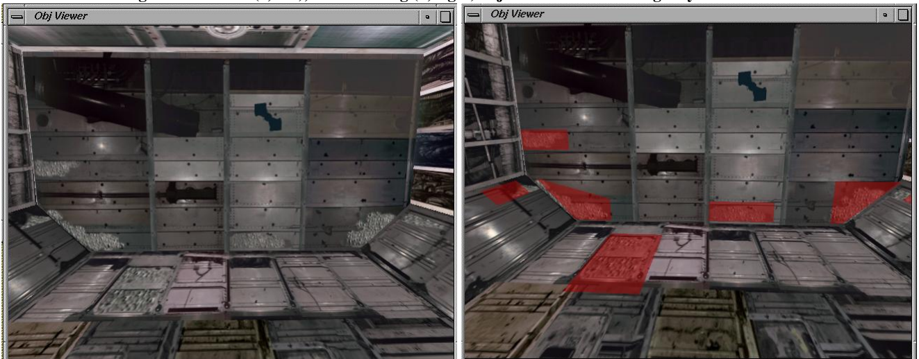
Figure 8: Registering ROIs in VR: (a, left) simulated corrosion; (b, right) highlighted environmental defects.